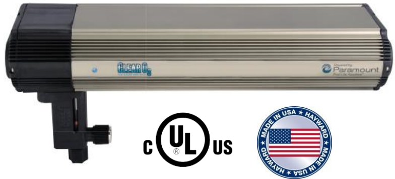
Ozone injected directly into pump suction