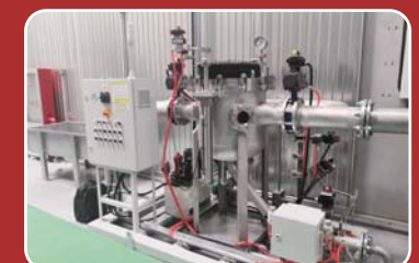
FerrocleanI Permanent Magnet Filter